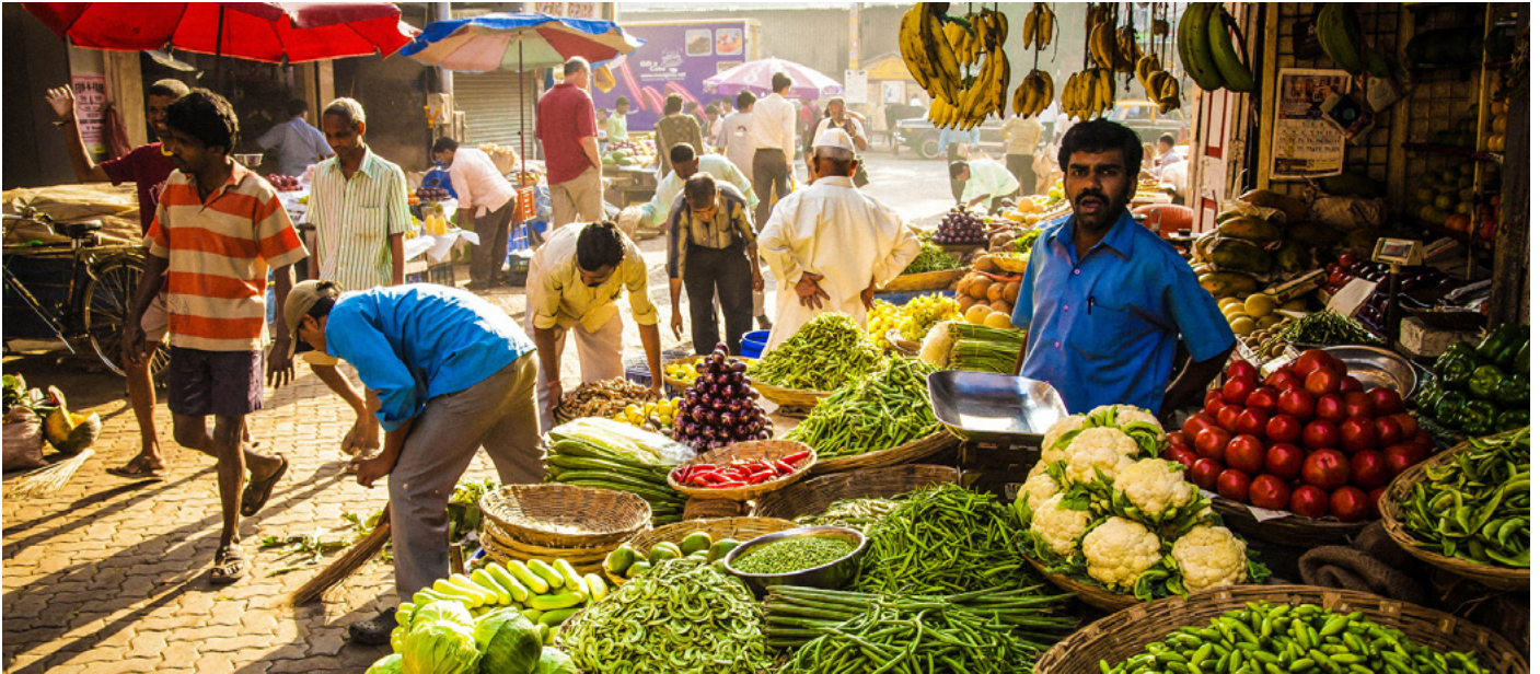
A market for fruits and vegetables in India