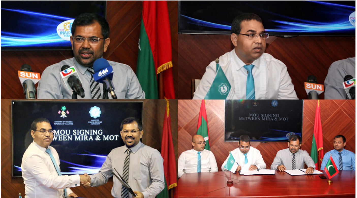
From the MOU signing ceremony between MIRA and the Tourism Ministry